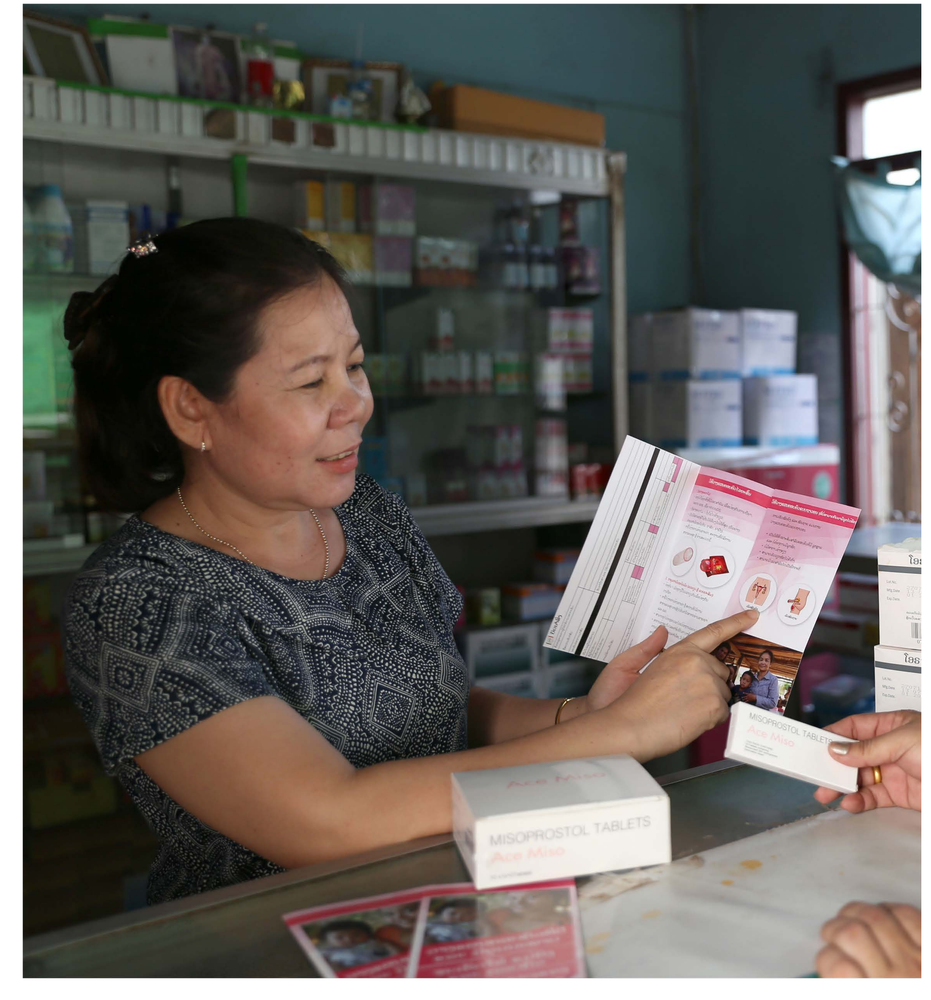
FIG 1 – A pharmacy attendant in Vientiane, Laos counsels a client on family planning and misoprostol for safe abortion and post-abortion care.

PSI has supported the MoH to disseminate the new guidelines to providers in all 17 provinces and Vientiane Capital.