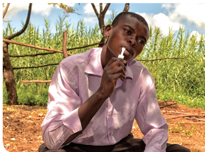
UNITAID STAR Project Zimbabwe.

For full WHO guidelines on HIV self-testing and partner notification: supplement to consolidated guidelines on HIV testing services see: http://www.who.int/hiv/topics/vct/en/